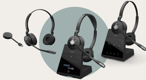
Engage 55, 65, 75