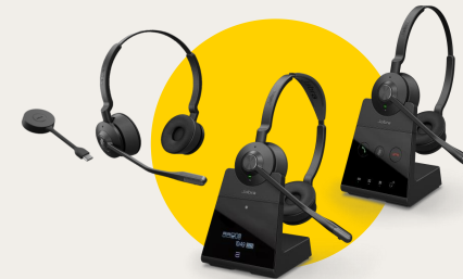
Engage 55 SE, 65 SE, 75 SE