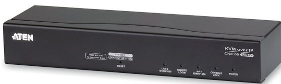
● CN8600 Front view