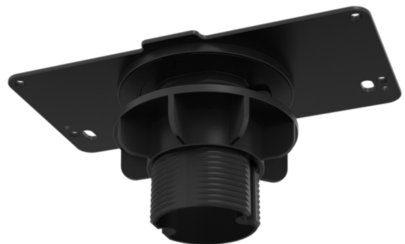
Table Lock Kit