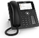
D785N | black | PN 00004599