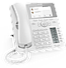
D785 | white | PN 00004392