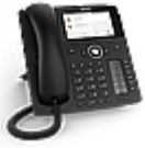
D785 | black | PN 00004349